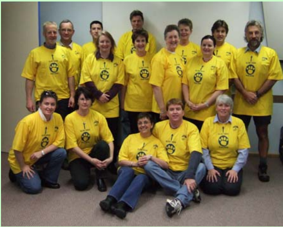
Tasmanian Red Cross First Aid Instructors

The ARC t-shirts are not only being used in the class room but also as a team uniform!