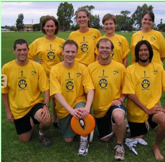
Dubbo medical students (and ultimate frisbee team) have selected the ARC T-shirt as their team uniform.